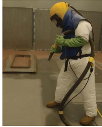
A Transfield worker does some blast work in the new facility.