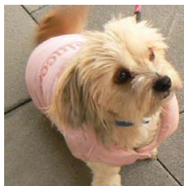
Sophie from SA Dog Rescue.

Also in July, ASC hosted SA Dog Rescue for collections. With the furry volunteers out the front of ASC North and ASC South in tow, employees donated $1500 to assist the organisation.