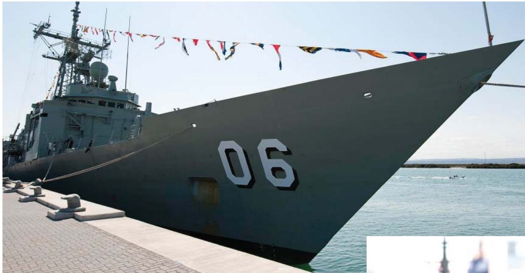
Above: HMAS Newcastle berthed at the Wharf down at Techport in Osborne. Right and below: ASC's air warfare destroyer and submarine models attracted a lot of attention during the Open Day.