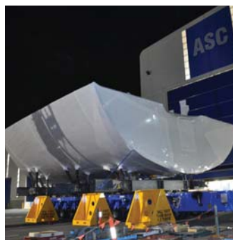
Ready for the next phase.