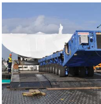
Block 109 ready to roll off the barge.

Construction has begun on all main blocks for the first ship and work has also begun on blocks for the second ship, HMAS Brisbane .