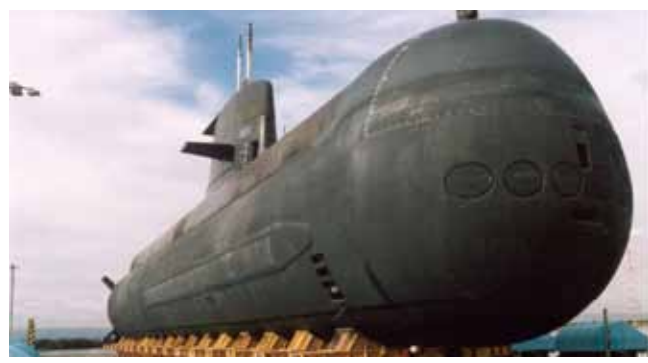
The six torpedo tubes can easily be seen on the front of HMAS Rankin.

HMAS Waller is the first submarine in the world to successfully fire the new Mk48 Mod 7 heavyweight torpedo, sinking a decommissioned warship off the coast of Hawaii during a military exercise.